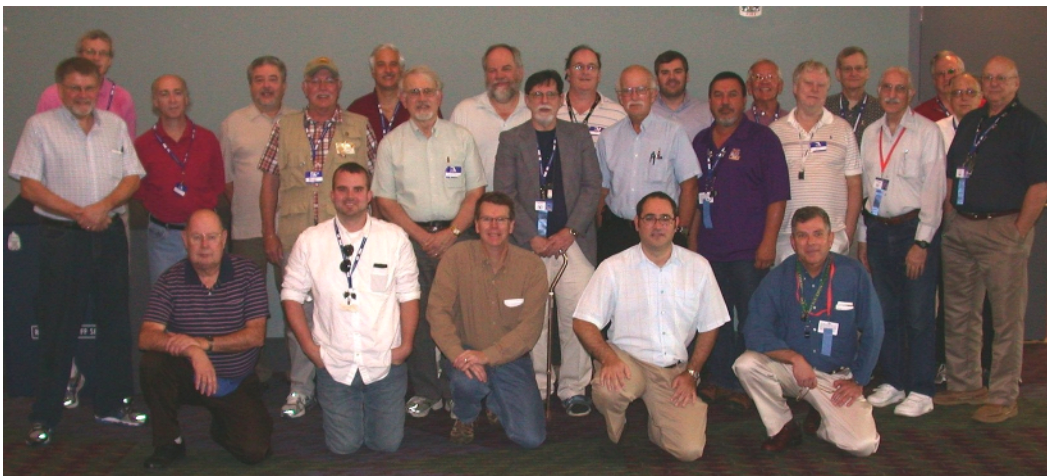
Attendees at the January 2013 FUN LSCC Regional Meeting (at least, those who were on time and wanted their photo taken)