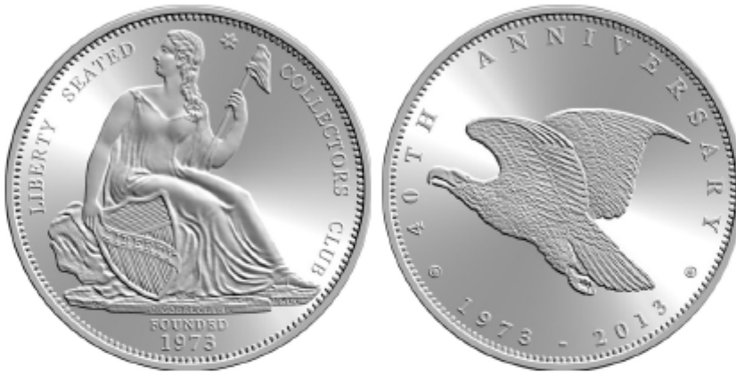
Silver Medal, Satin Finish Example