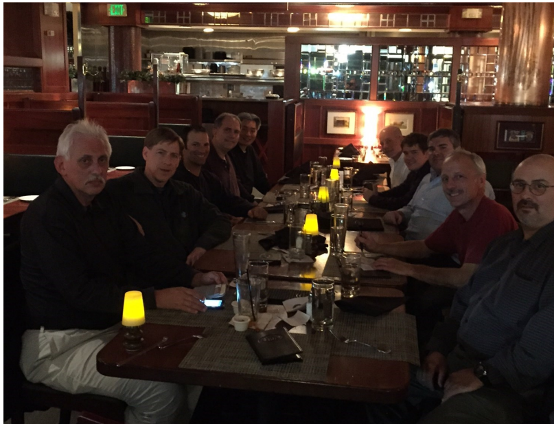
Some of the meeting attendees (above) and a group dinner (at right)