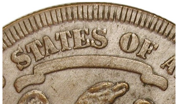
Uneven denticles, no E PLURIBUS UNUM