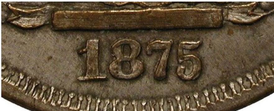
Tooling at date, no IN GOD WE TRUST on ribbon