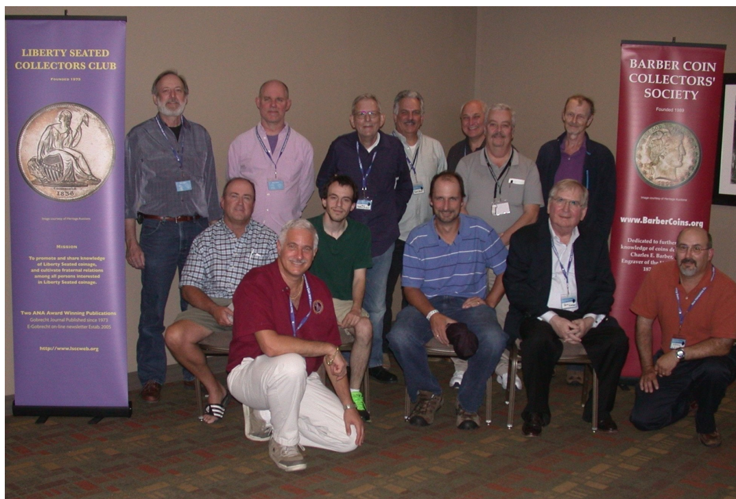
Group photo from the Manchester, NH LSCC/BCCS regional meeting

We spoke to many collectors of all different interests and several YN's. The club signed up one new member and we have several hopeful candidates with membership sign-up brochures. I can't wait for March!