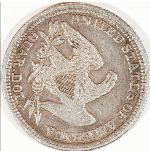
1848 Quarter Dollar with 90° clockwise rotated reverse