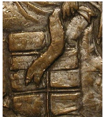
No LIBERTY, featureless bale

All in all, this is a rare and interesting piece, which is in sharp contrast to the modern fake Trades we are all accustomed to.